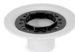
PLANTER BOX CLAMP RING

Spec sheets and install details available for download from allproof.com