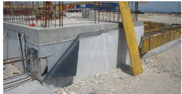
Installation of T KONE G DRAIN as drainage layer towards a wall

HDPE studded membrane, 8 mm thick, for foundation and underground structures, used for mechanical protection of waterproofing membranes. Based on the decreasing surface mass, there are subtypes T Kone and T Kone S while T Kone G Drain is a HDPE studded membrane, 8mm thick, with one nonwoven textile, used for mechanical protection of waterproofing and drainage. T Kone Star has a special dimple shape (star dimple).