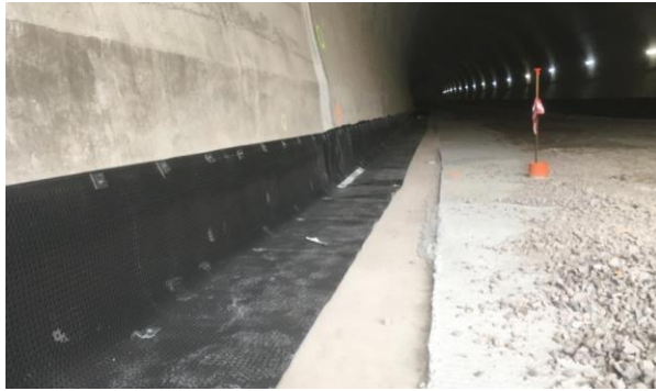
Installation of TMD 1011 as water collection layer in an artificial tunnel

are requested. Available versions are 1011 and 1011 plus that also has a LDPE film on the backside.