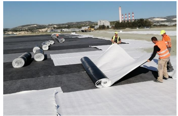
Installation of MD 4 50 12F as drainage layer in a landfill

It is a product to be used as leak detection or as drainage layer in multi layer waterproofing systems.